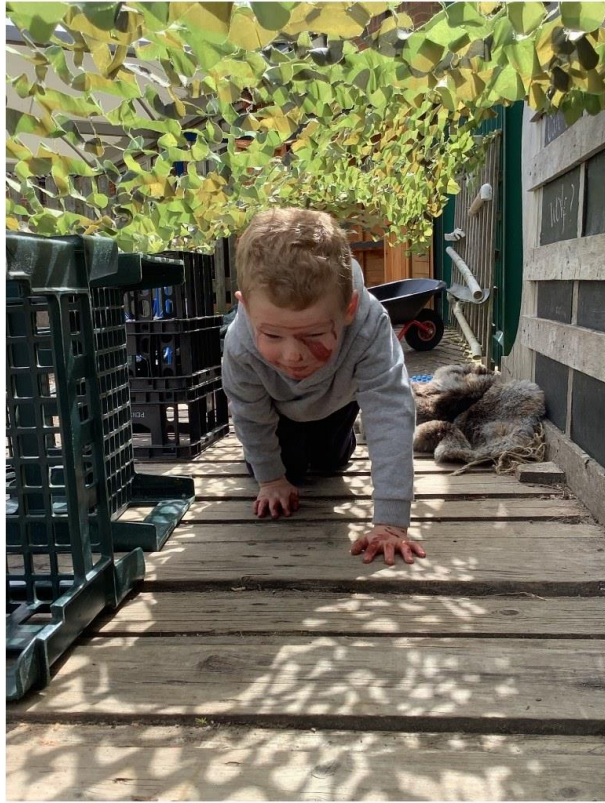
Year 2 Photos